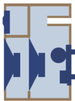
MOMENTUM SX3i Internal